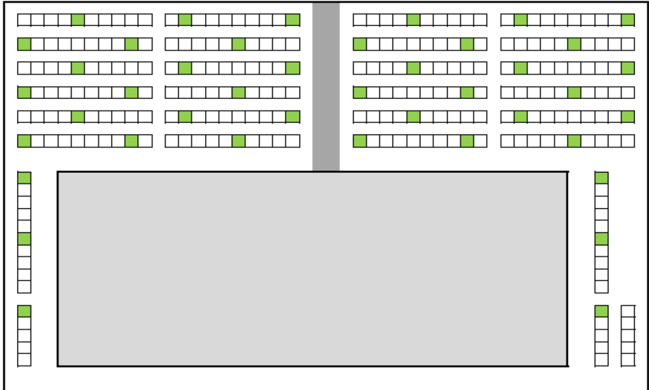
Layout No.2 - Upper Main Sanctuary

10. If you are here alone, you will be ushered to the Upper Hall. Available seats are labelled green.