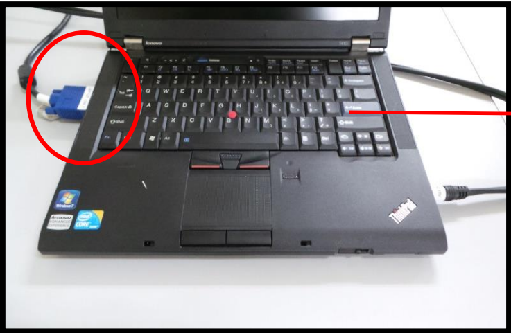
Connect to laptop