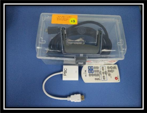
* Remote / VGA cable / HDMI to VGA Converter