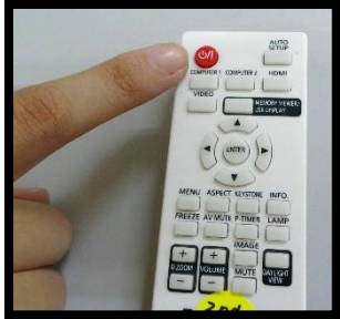
Turn On & Shut Down Projector